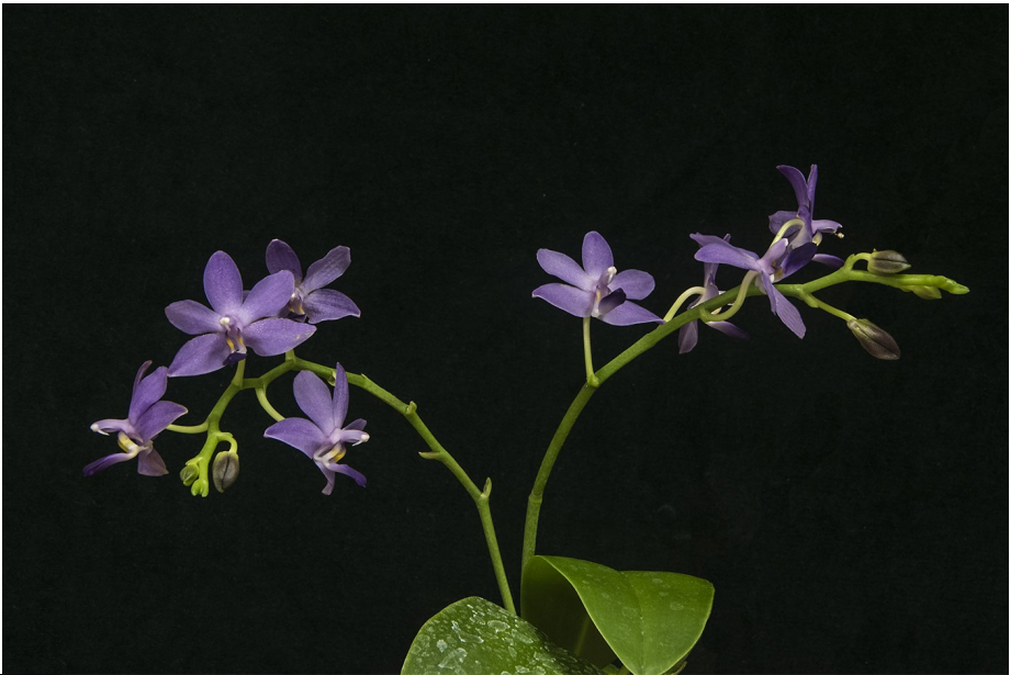
Phal. Kenneth Schubert